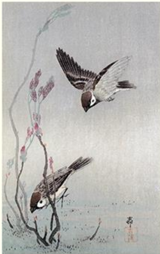
21 Eurasian tree sparrow ( Passer montanus ), 150 x 210 mm