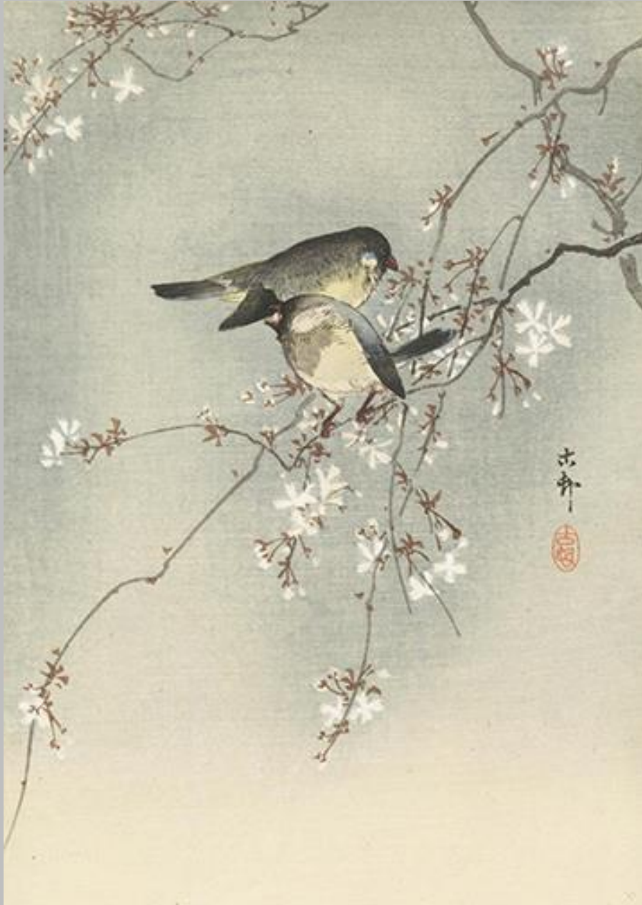
9 Cherry ( Prunus sp.) and Java sparrow ( Padda oryzivora ), 120 x 165 mm