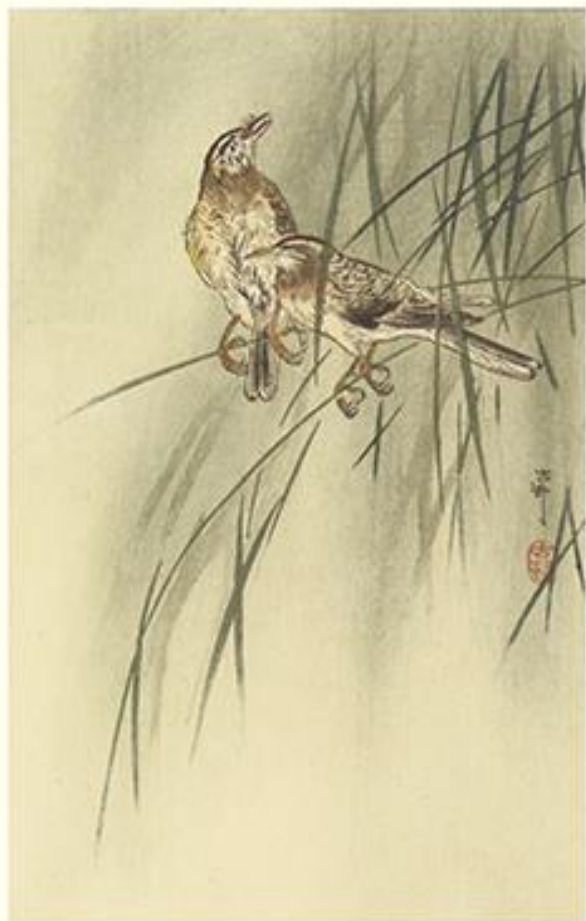
23 Oriental reed warbler ( Acrocephalus orientalis ), 150 x 205 mm