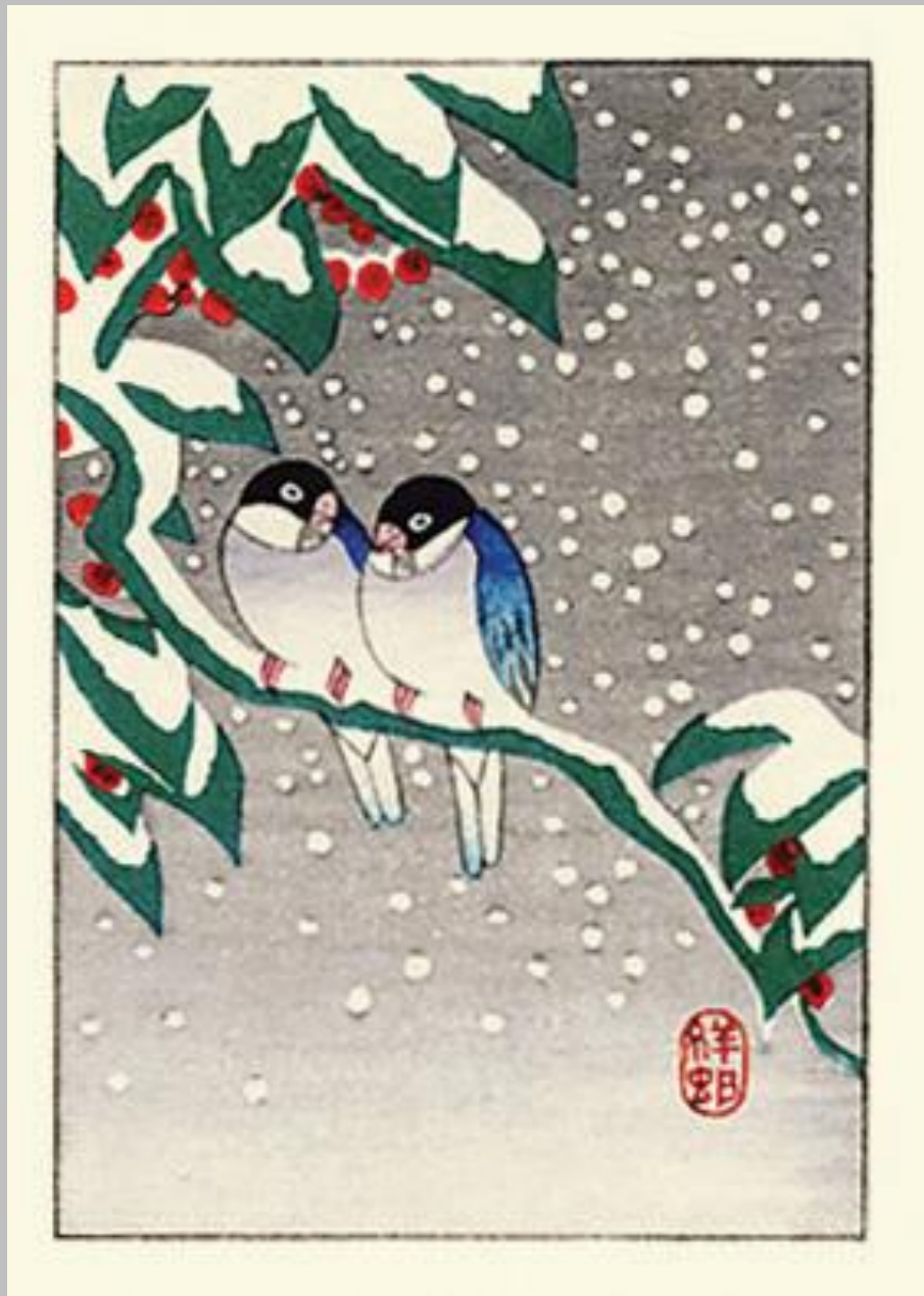
1 Japanese laurel ( Aucuba japonica ) and Java sparrow ( Padda oryzivora ), 75 x 105 mm