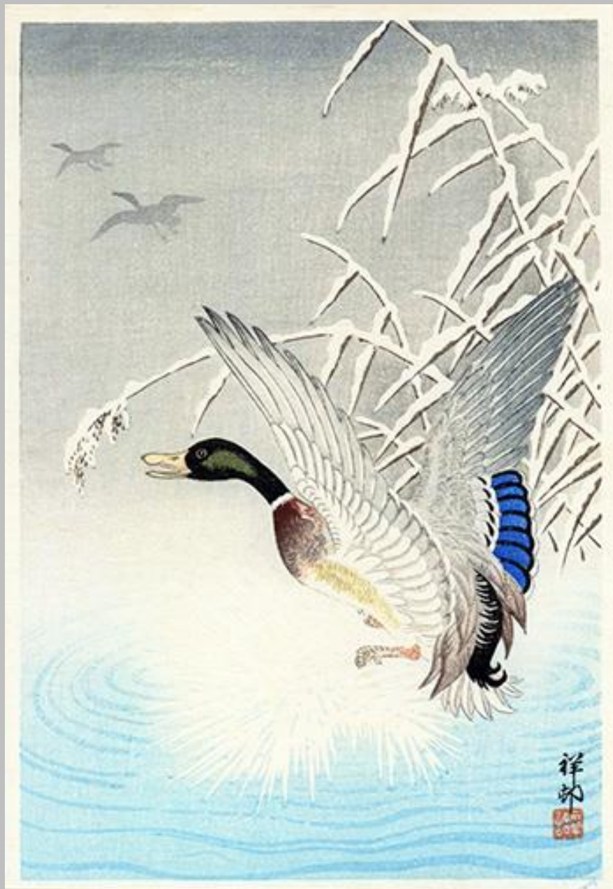
27 Common reed ( Phragmites australis ) and mallard duck ( Anas platyrhynchos ), 175 x 255 mm