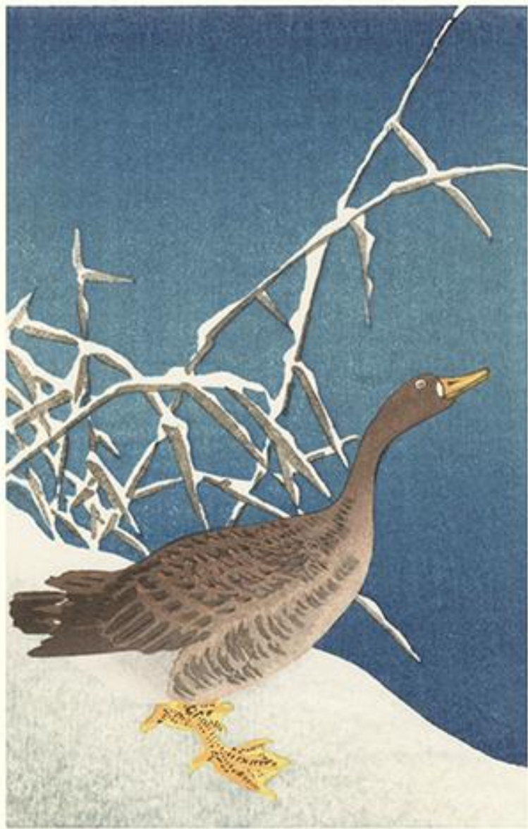
11 White-fronted goose ( Anser albifrons ), 115 x 180 mm