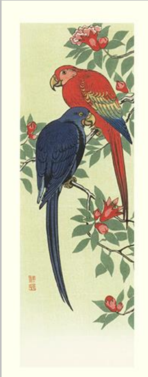
25 Pomegranate ( Punica granatum ), scarlet macaw ( Ara macao ) and hyacinth macaw ( Amdorhynchus hyacinthinus ), 105 x 265 mm