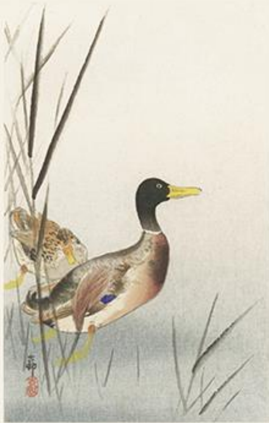
19 Mallard duck ( Anas platyrhynchos ), 150 x 210 mm