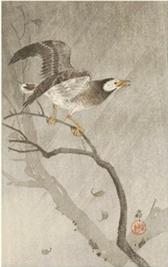
17 White-cheeked starling ( Sturnus cineraceus ), 145 x 205 mm