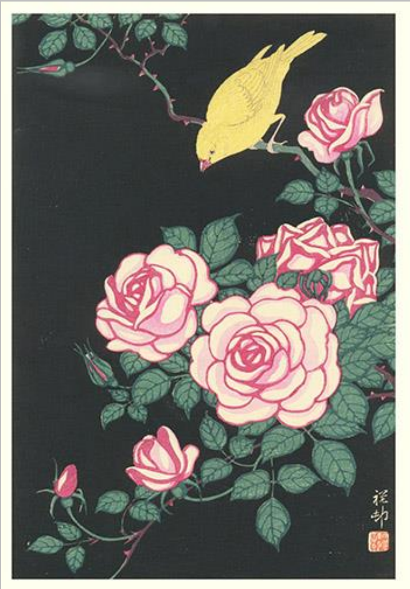
29 China rose ( Rosa chinensis ) and canary ( Serinus canaria ), 185 x 255 mm