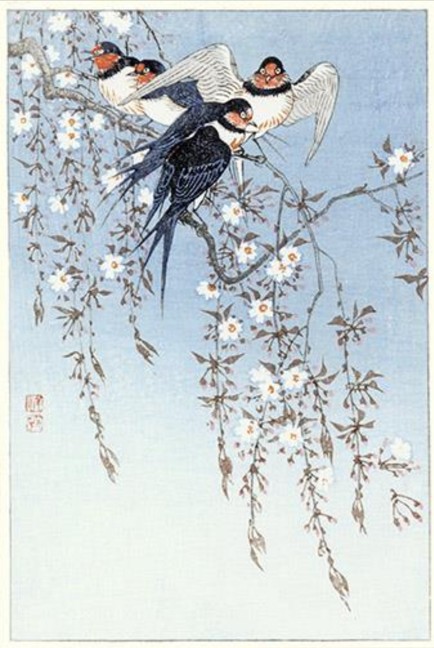
13 Cherry ( Prunus sp.) and barn swallow ( Hirundo rustica ), 125 x 185 mm