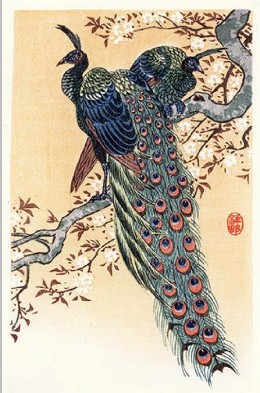
3 Cherry ( Prunus sp.) and green peafowl ( Pavo muticus ), 90 x 140 mm