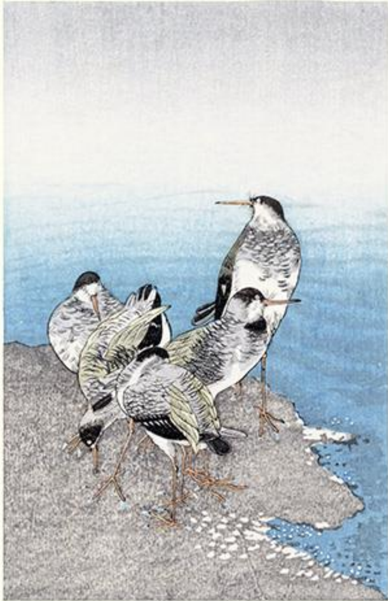
5 Little ringed plover ( Charadrius dubius ), 100 x 155 mm