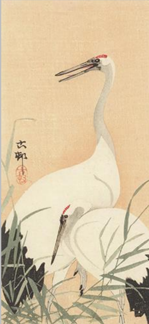
15 Red-crowned crane ( Grus japonensis ), 95 x 200 mm